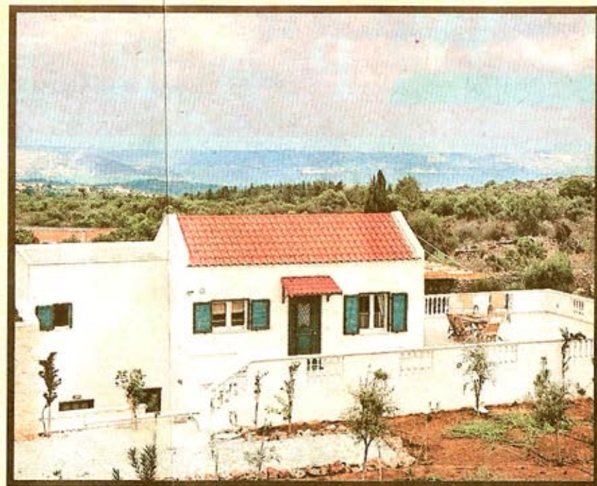
Just two of the nine individually-designed villas at the Litsarda Villas development, in western Crete

CURRENTLY available close to the idyllic village of Litsarda, in western Crete, is a development of nine individually-designed homes in an elevated location, which enjoy panoramic views of Crete's White Mountains and Souda Bay, in the Mediterranean.